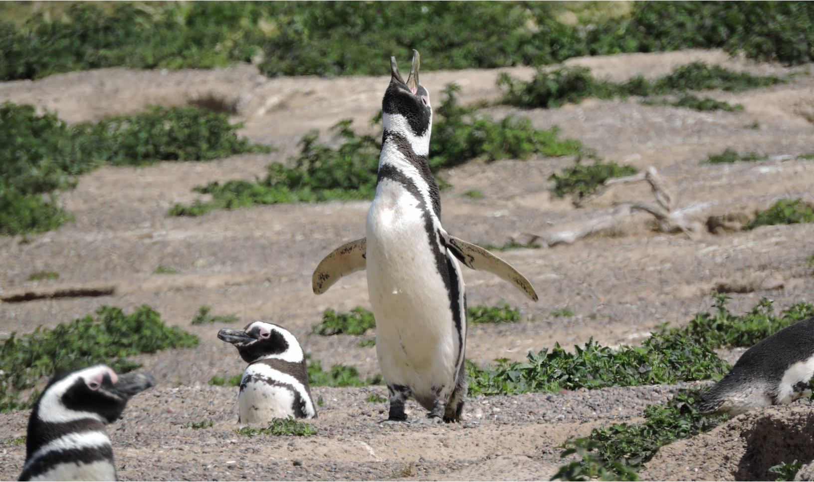
Magellanic Penguin