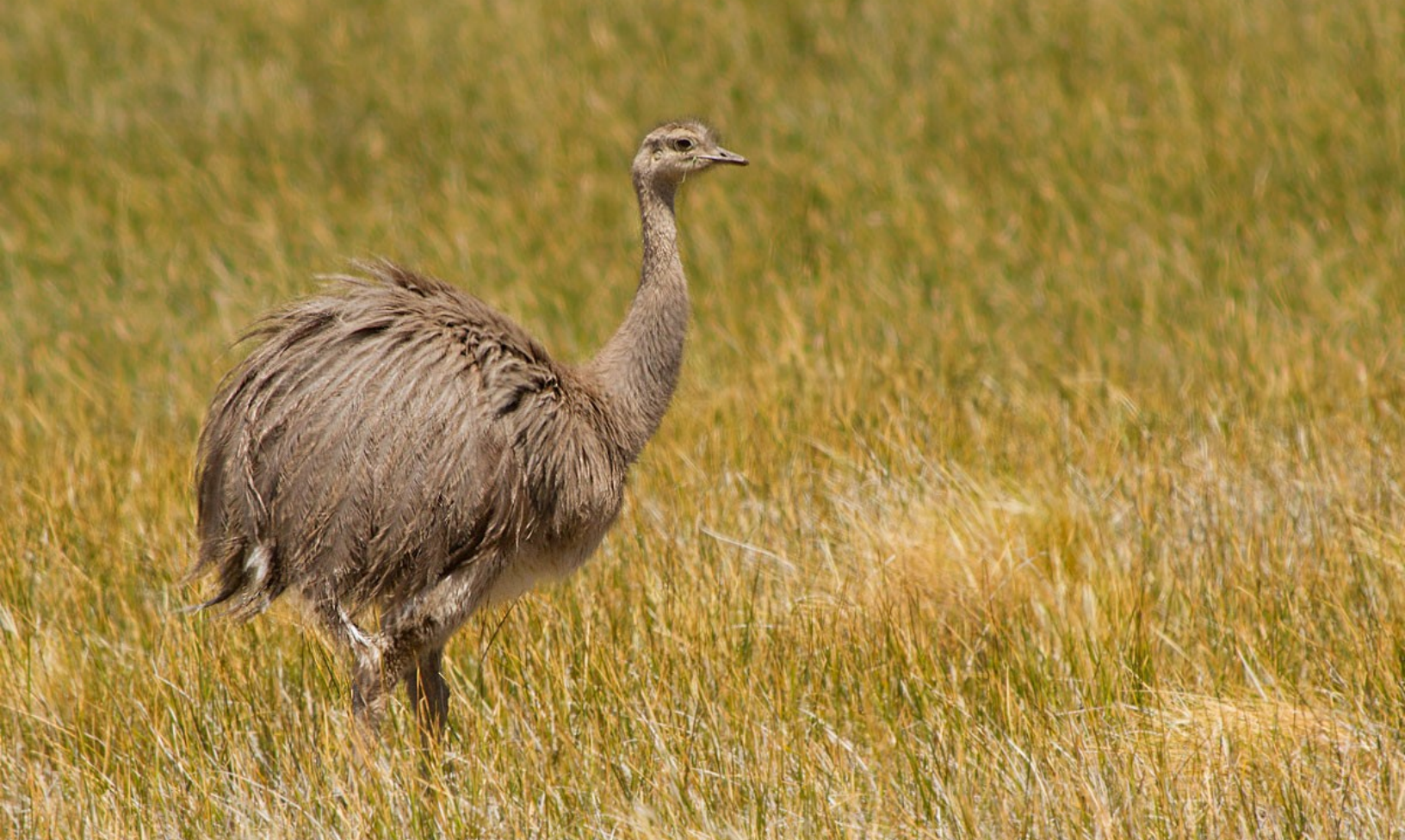
Lesser Rhea – © Jorge La Grotteria