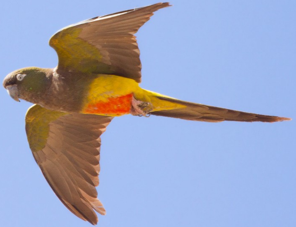
Burrowing Parakeet - © Jorge La Grotteria