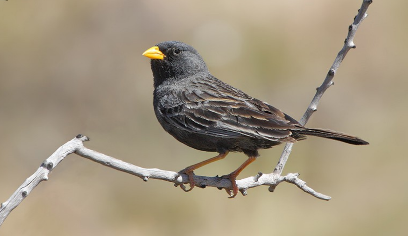
Carbonated Sierra-Finch