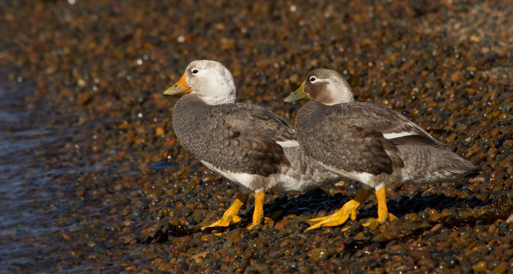
White-headed Steamer-Duck